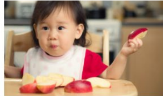
Nutrition, Health & Safety