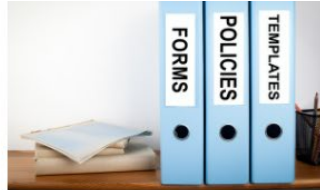
Forms, Policies & Templates