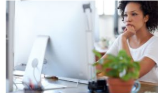
Training & PD